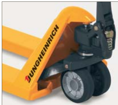
Permanently lubricated connections for maintenance-free operation

The chromed bearing bushes and joints ensure quiet running properties and particularly long service life. It is no longer necessary to lubricate connections; the AM 22 operates like "grease lightning" all the same.