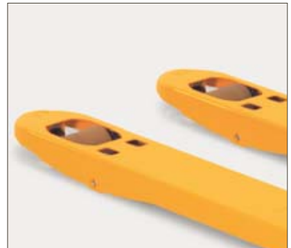
Rounded fork tips for easier pallet entry

Stronger forks. Rounded forms. Welded tiller mounting. Protected entry rollers. More hardened steel. First-rate guarantees for maximum stability and durability. 2200 kg capacity in the basic version speaks for itself!