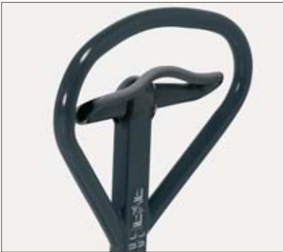
The operating element can be used from any position

The convenient operating element is ideally suitable for both left and right handers. Exceptionally sensitive or proportioned lowering of loads through special lowering valve. The optional fast lift (up to 120 kg) ensures ground-clear lifting of Euro pallets with only three pump actions. The maximum lift height is reached after only five pump actions.